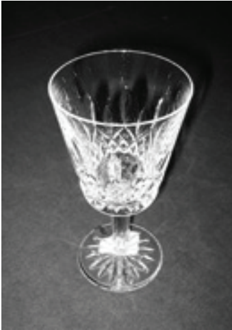
Stafford Award Goblet

TAF presents the Suzanne Stafford Memorial Award to an outstanding arts volunteer in Tippecanoe County. Stafford Award recipients are life long contributors to the arts and provide a valuable perspective to the evolution of the arts in the region.