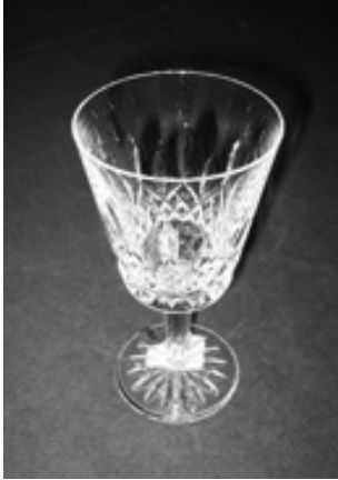
Stafford Award Goblet

TAF presents the Suzanne Stafford Memorial Award to an outstanding arts volunteer in Tippecanoe County. Stafford Award recipients are life long contributors to the arts and provide a valuable perspective to the evolution of the arts in the region.