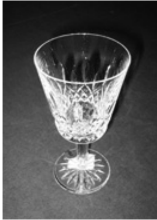
Stafford Award Goblet

TAF presents the Suzanne Stafford Memorial Award to an outstanding arts volunteer in Tippecanoe County. Stafford Award recipients are life long contributors to the arts and provide a valuable perspective to the evolution of the arts in the region.