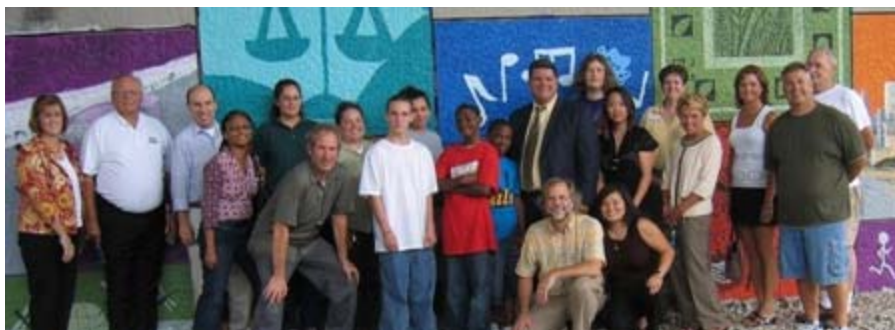
Mural Art Initiative

The results of the synergies that existed in the second half of FY08 included delivery of programs and services to 14 counties, over 525,000 fellow citizens impacted, and a nearly $40,000 swing to the good financially.